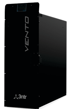
Vento Intelligent Material Dryer